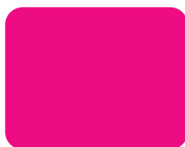
Erythrosine C.I.No: 45430