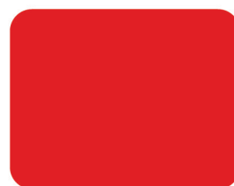
Allura Red C.I.No: 16035