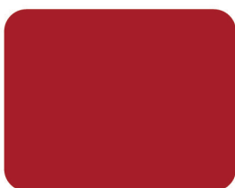
Ponceau 4R C.I.No: 16255