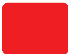
Red 2G s C.I.No: 18050